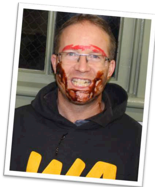
Image: K-Dawg demonstrating what happens to you if you don't keep moving on camp and the kids and volunteers are armed with paint and barbecue sauce!

Okay, so that was actually only half a day... And now I'm dog-tired.