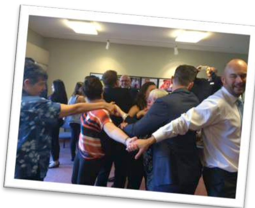
Image, left: The staff, Board members and referral agents of ERCWA enjoying a team-building game of 'human knot' during the Referral Network Event.

Traditional ERCWA games like balloon popping and the human knot were coupled with a serious side of volunteer speeches and a discussion around the benefits received.