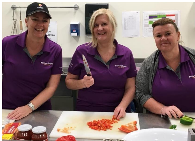
(Beyond Bank Cooks)