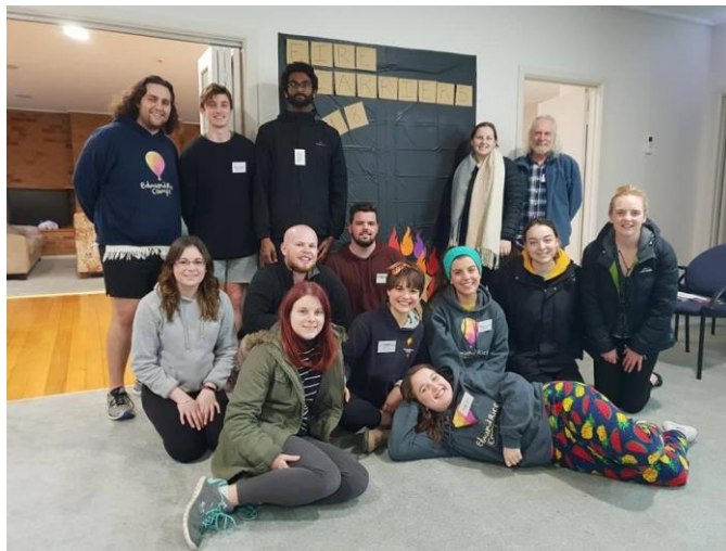
(Right Image: August Fire Carriers from all over Australia)