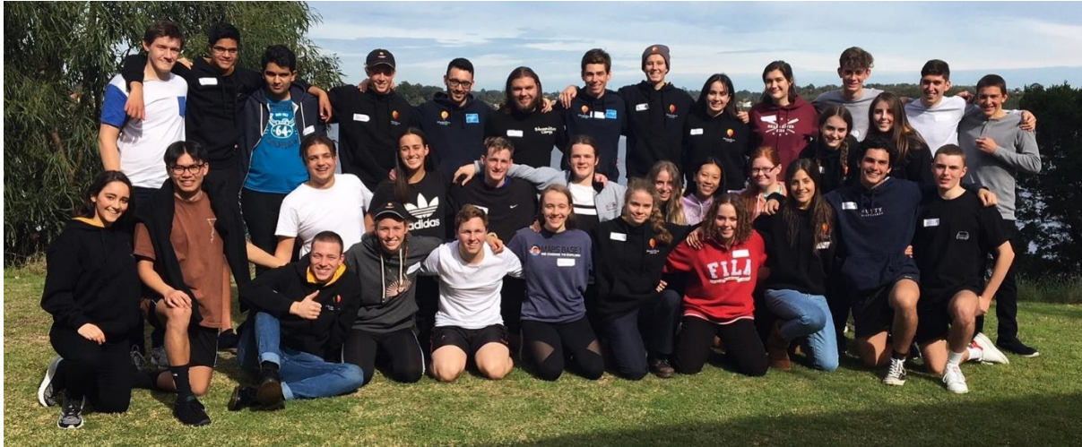
(CAMP 1 Leaders)

WOW what a blast our 2018 July Programs were. Thank you to the village of volunteers that made it happen! Our July Programs comprised of 2 week long camps over the July school holidays at Moore River with both camps accommodating 70 people each from children, leaders, camp management to cooks and drivers. Thank you also to our Volunteer Leader Committee who organised a resource drive for July Programs. We had plenty of amazing items donated and were used on the programs. Again thank you to all those who donated and were involved in our July Programs. GO TEAM!