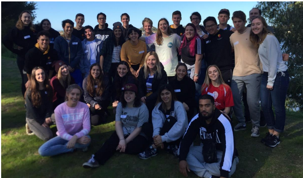
(CAMP 2 Leaders)