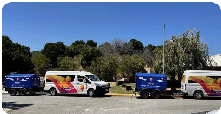
The new artwork on our Eddie Rice buses and trailers, thanks to various sponsors and a Lotterywest grant.