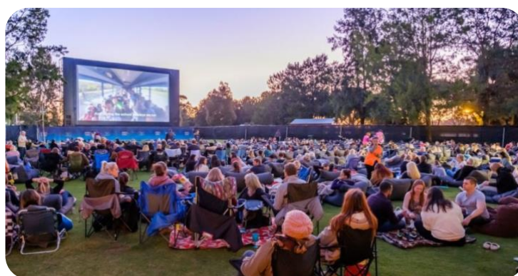
Guests enjoying Telethon Community Cinemas (TCC) in Burswood, as the sun goes down.

We received a total donation of over $125,000, including almost $13,000 of product and in-kind support. This is of huge value to us as we are able to use it on a number of our programs and events, such as the Quiz Night, our annual calendar of residential programs, and our Sticky Rice Kids Christmas Party.