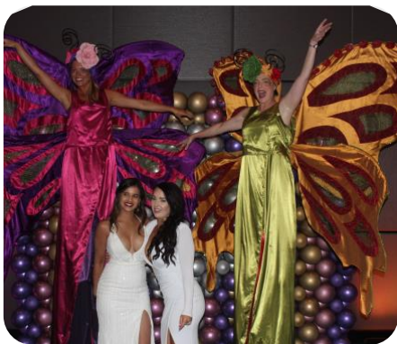
Guests enjoying a photo opportunity with the still-walkers at our annual Gala Ball.

We are so grateful for the positive vibe created for us on the night and the generosity our guests and sponsors showed in generating over $45,000 for our organisation to assist with running respite programs for WA children who are disadvantaged and 'at risk'.