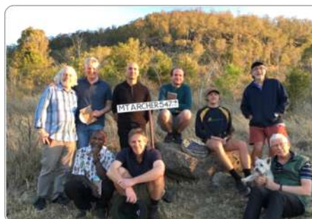
Left image: Our Volunteer Leaders at our January Mega Camp sign-up night.